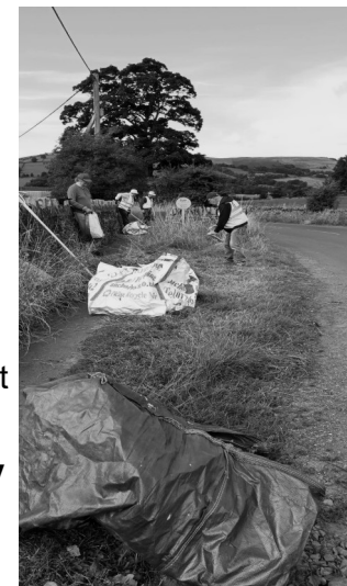
Scything on Ings Lane

Please get in touch with secretary@bradleyinbloom.com if you would like to volunteer or need further information.